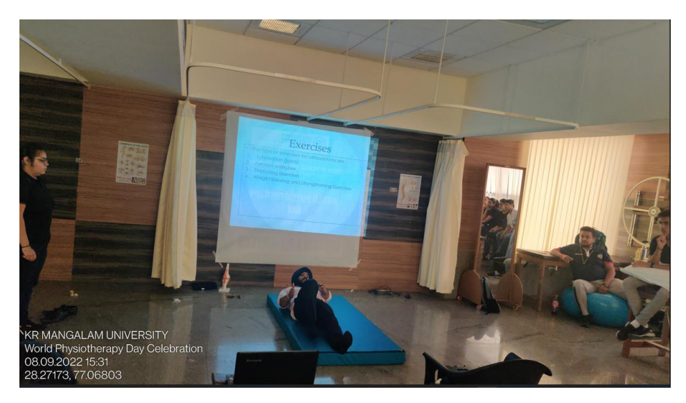
Talk by an Expert Session on Osteoarthritis