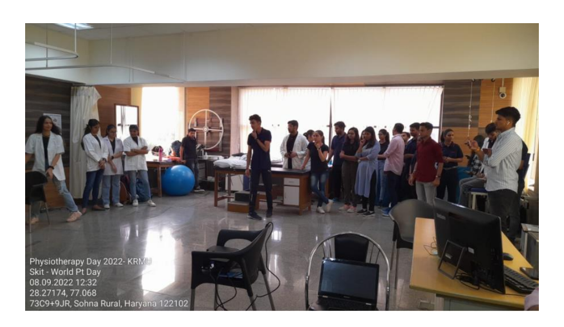
Skit Performance by the Students