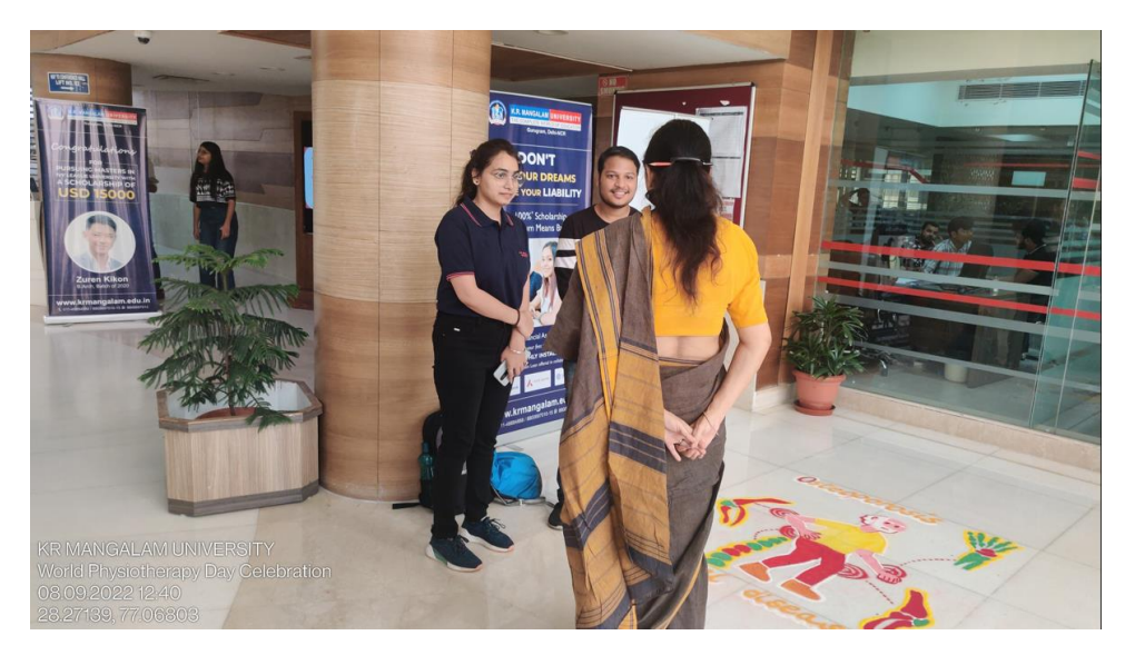
Rangoli Competition among Students