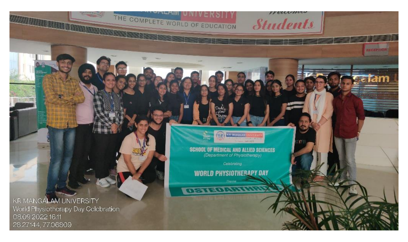
Physiotherapy Department, KR Mangalam University