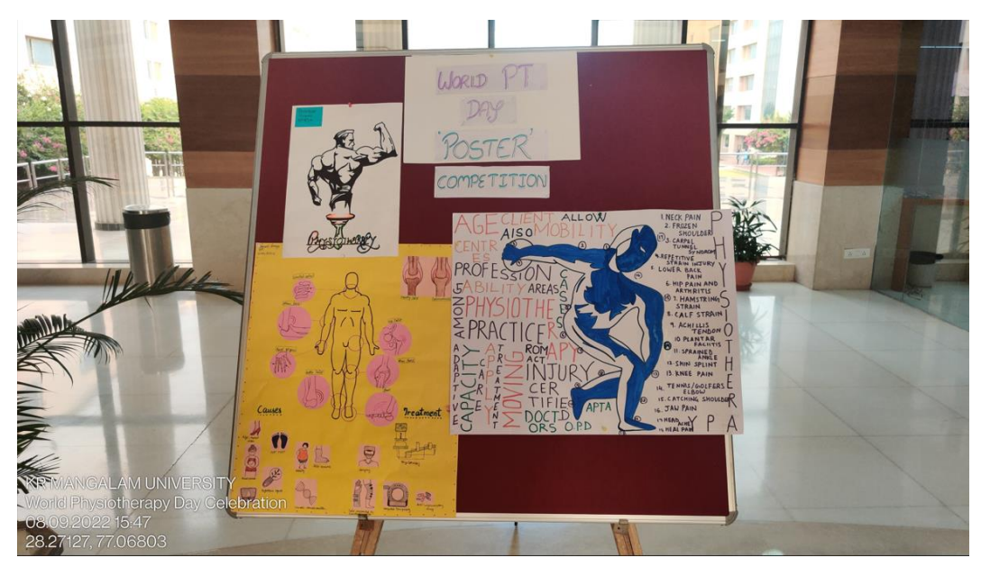
Poster Competition among Students