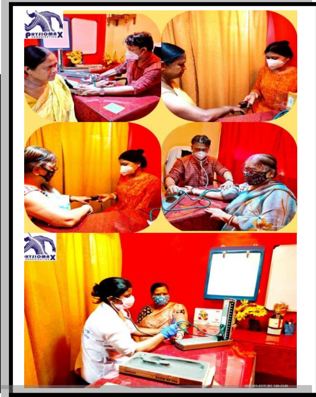
FREE HEALTH CHECKUP CAMP