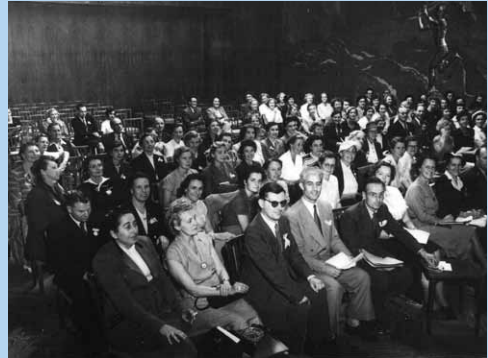
Delegates at WCPT's inaugural meeting on the morning of 8 th September 1951, in the Ingeniorhuset Restaurant, Copenhagen.

It was, and remains, the only organisation representing all physical therapists from every corner of the world.