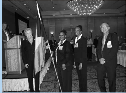
The Bahamas Association of Physiotherapists was one of ten new member organisations admitted to WCPT in 2007.

There were just 11 member organisations at the first General Meeting in 1951.