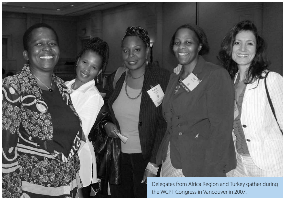
Delegates from Africa Region and Turkey gather during the WCPT Congress in Vancouver in 2007.

“When WCPT was 50 years old, we reflected upon how far we had come as a profession since the beginning – toddling back to the place in Denmark where WCPT was first constituted, seeing how the profession had changed over that time. Regionalisation was more successful than ever dreamed of, and during my presidency, the growth of membership, particularly in Middle East, stands out.”