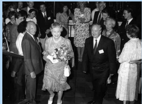
Queen Elizabeth II of the United Kingdom is introduced to delegates at the 1991 WCPT Congress in London.

The statements have continued to lay down a clear professional view on issues such as specialisation, educational level, use of support personnel and autonomy.