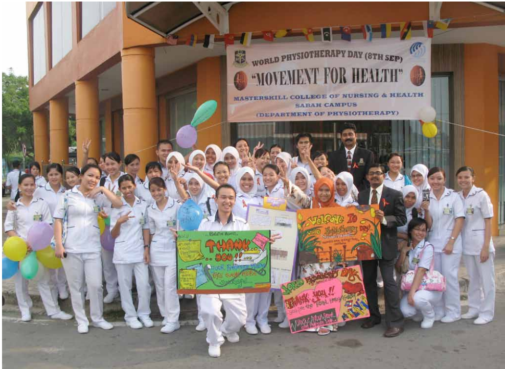
Top image: Physical therapy students at Masterskill College in Malaysia celebrating World Physical Therapy Day in 2009.