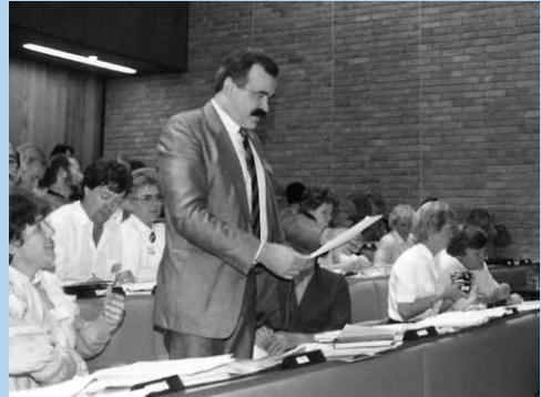
Delegates at the WCPT Special Meeting held in London in 1988, made necessary because the General Meeting in Sydney had been boycotted by some physical therapists in protest at apartheid.

The 1980s saw physical therapists in debate about how to best address the types of inequalities exemplified by apartheid in South Africa. They united behind professional colleagues through WCPT and jointly held ethical principles.