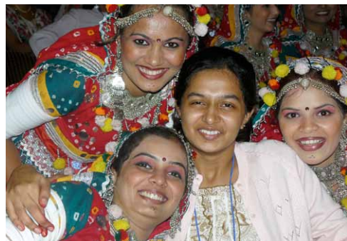
Right image: Physical therapy students from India put on national dress and performed traditional dancing during the opening ceremony of WCPT's Asia Western Pacific Congress, held in Mumbai in January 2009.