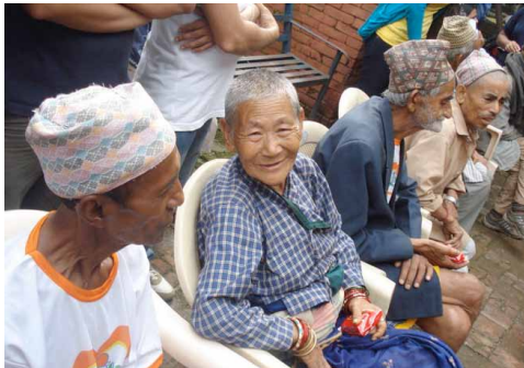
Left image: World PT Day events in Nepal in 2010 included demonstrations of how physical therapists could improve quality of life in older people.