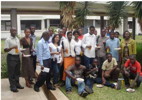
Left image: Students from the first ever qualifying education programme for physical therapists in Malawi, which started in 2010 after 17 years of planning.