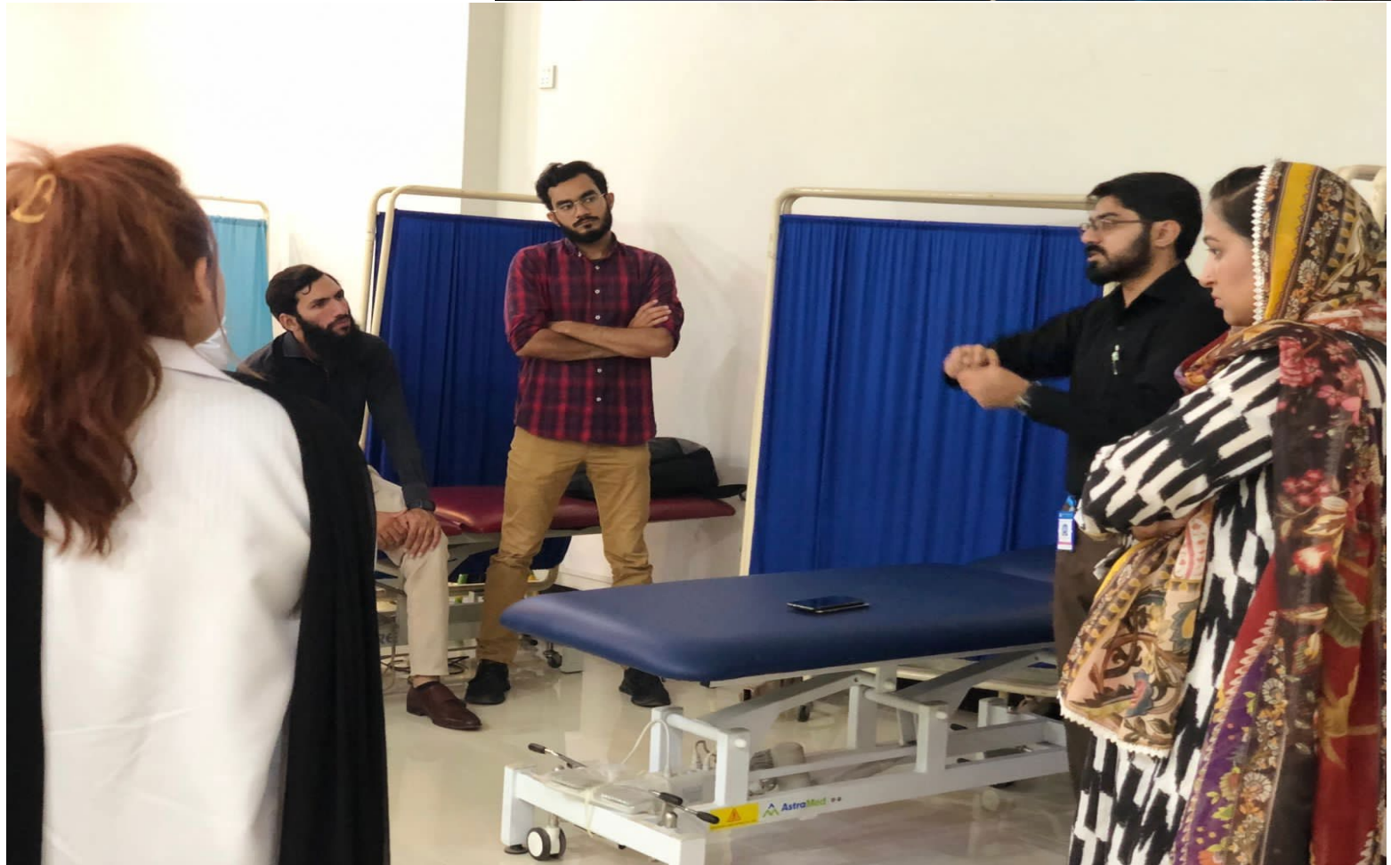
Glimpses of the hands-on session regarding Role of Physical Therapists in Knee Osteoarthritis delivered by faculty members of Department of Rehabilitation Sciences, STMU