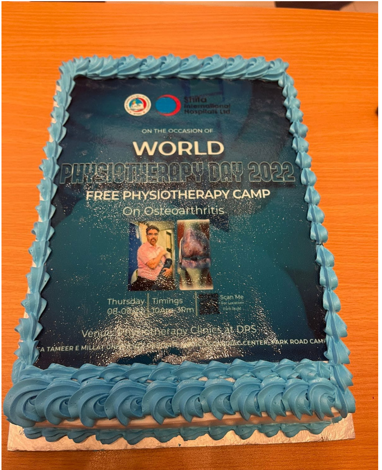
Cake Cutting Ceremony at Shifa Tameer-e-Millat University