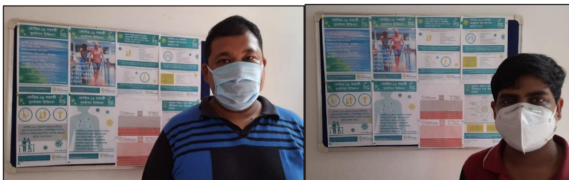
World PT Day posters displayed on clinic's notice board for patient awareness