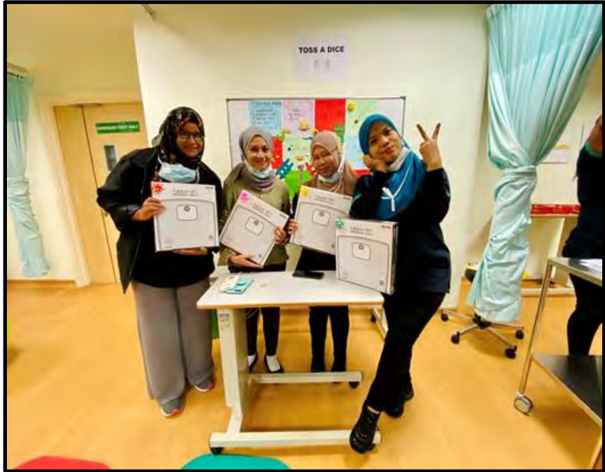
TOSS THE DICE