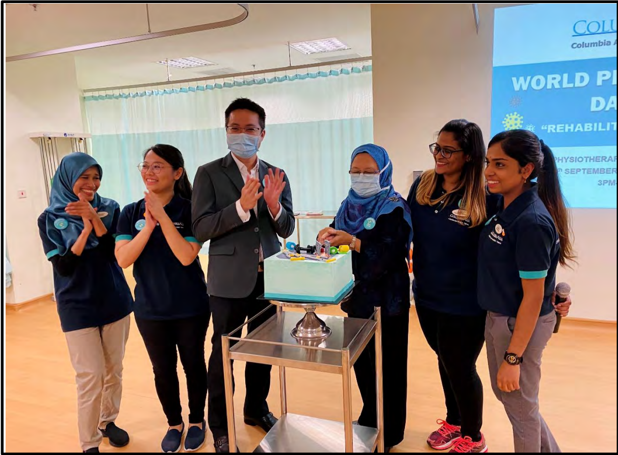
A CAKE TO END A WELL CELEBRATED DAY WITH THE TEAM