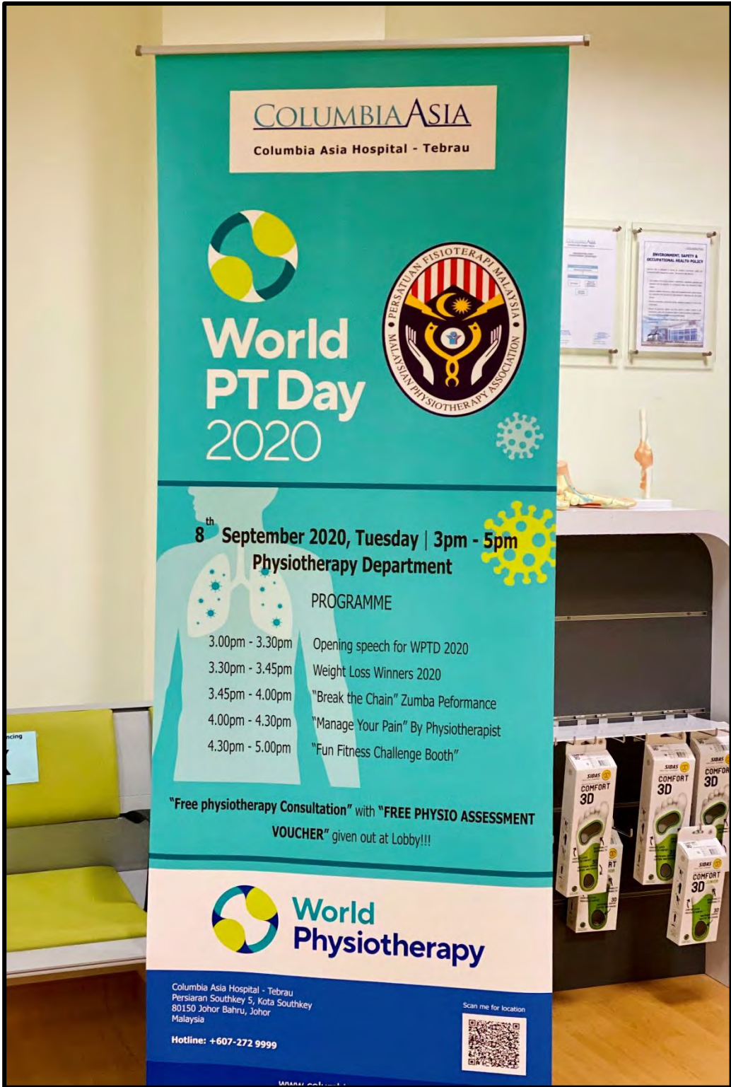
WORLD PT DAY 2020 BUNTING