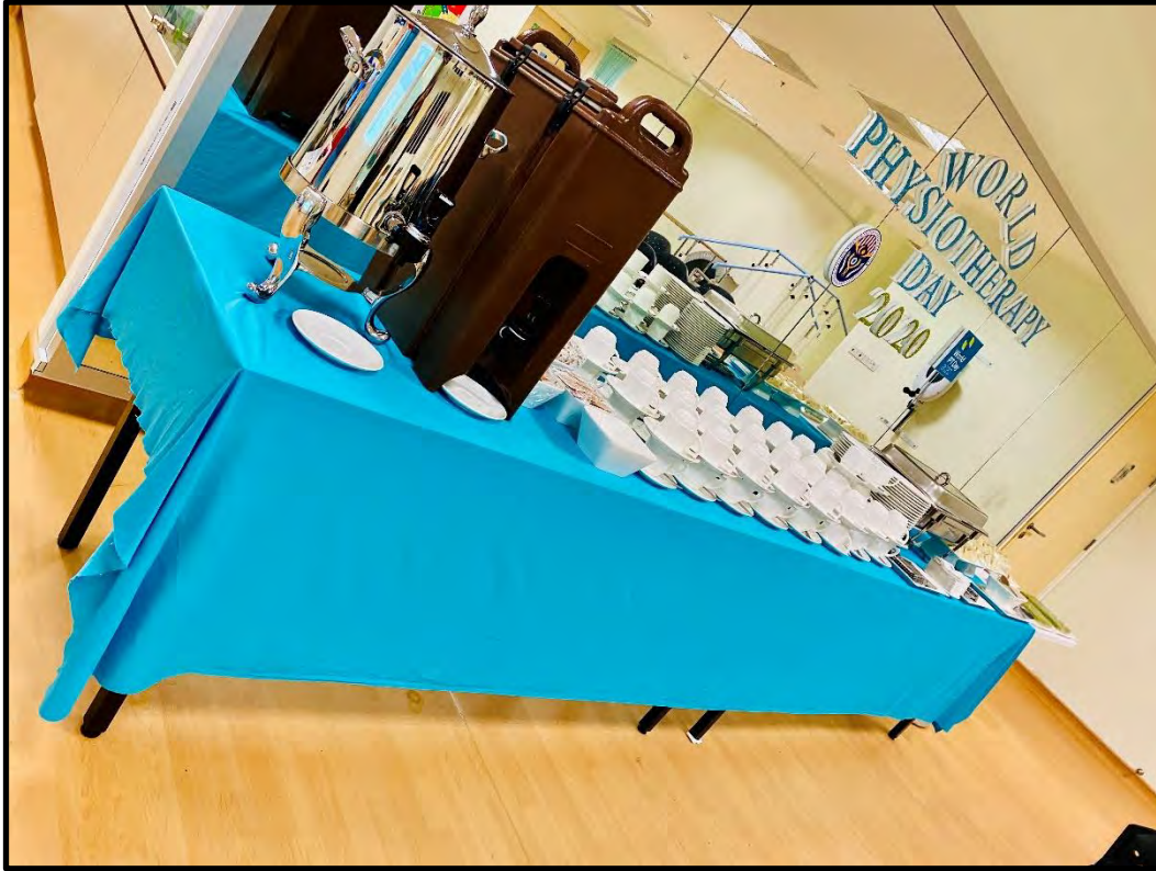
LIGHT REFRESHMENT SERVED FOR OUR PARTICIPANTS