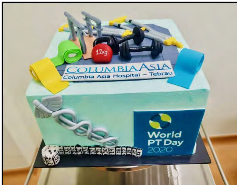
WORLD PT DAY 2020 CAKE