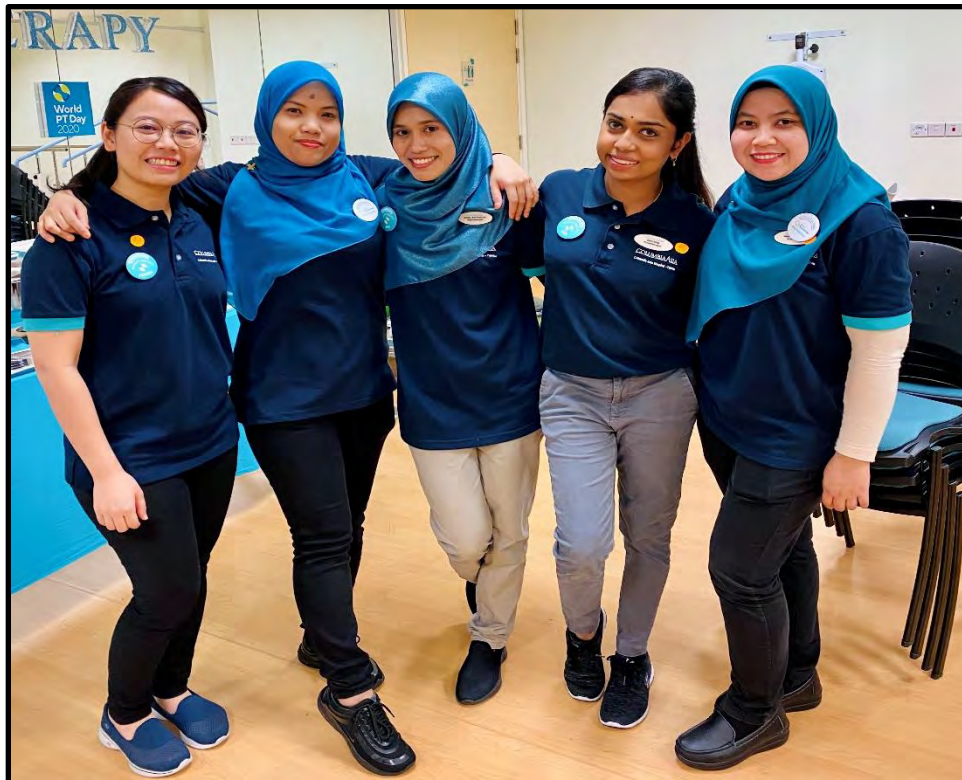
Physio team conducted a Zumba performance in conjunction with the theme titled "Break the Chain". Participants were asked to join in and perform the "SEVEN STEPS OF HAND HYGINE", as frontlines