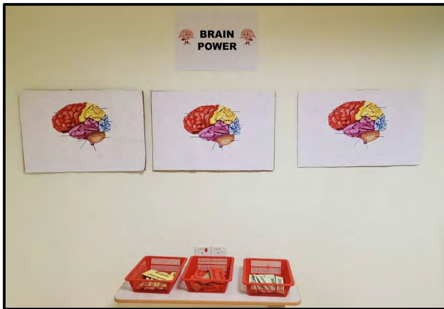
BRAIN POWER BOOTH