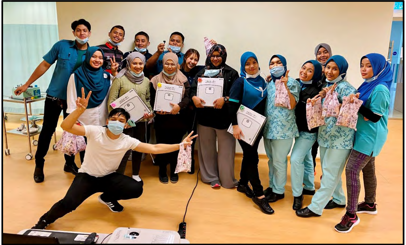
WINNERS OF THE FUN FITNESS CHALLENGE